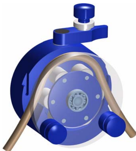
3. insert appropriate tube

At the first time of usage please control the pressure of tubing and if necessary adjust it (see manual )