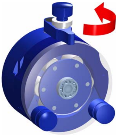
1. open pivoted lever