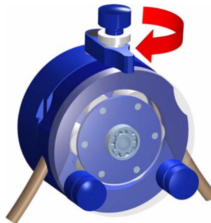
5. close pivoted lever until it locks