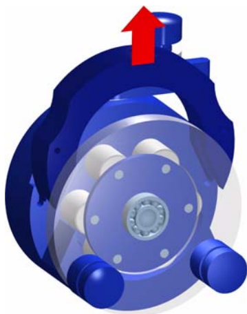
2. remove tube cartridge